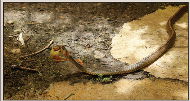
FIG. 1. Adult Chironius bicarinatus preying on a Boana albomarginata , which was displaying defensive behaviors (e.g., inflating its body) in São Paulo, Brazil.

The C. bicarinatus was seen in a residential area of the city. When the villagers approached, the snake assumed a defensive posture, raising approximately one-third of its body off the ground. After a few minutes in this posture, the snake turned and