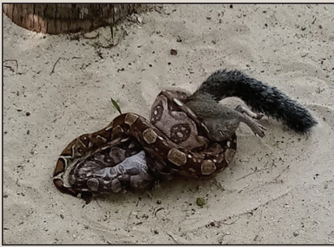
FIG. 1. Boa imperator eating Sciurus yucatanensis in Quintana Roo, México.